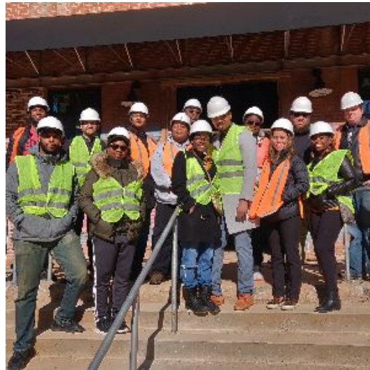
Another chilly but successful Thursday morning hard hat tour of Pittsburgh Yards and The Nia Building. The tours are held every Thursday at 10:45 a.m.