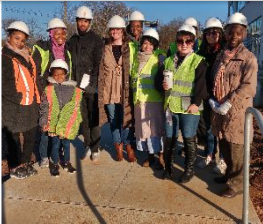
The Farmers' Market working group explores the Pittsburgh Yards campus looking for the perfect place to host future farmers markets and healthy food-related events.