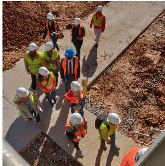
Members of a recent hard hat tour as they approach The Nia Building