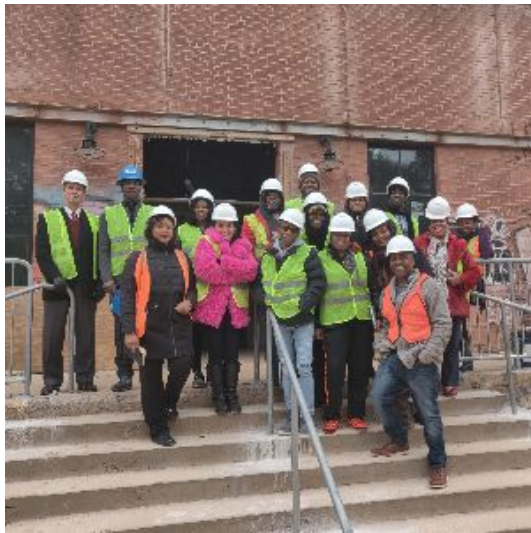
Community members at one of the recent hard hat tours of Pittsburgh Yards and The Nia Building